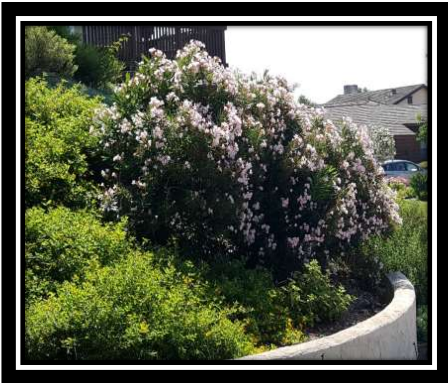
Nerium Dwarf Pink Oleander

The Oleander is an evergreen shrub or small tree that is prized for its showy, funnel-shaped blooms. These moderate to fast growing, low maintenance evergreens were once the basic landscaping shrubs for regions with hot dry summers and mild winters. There are several of these shrubs scattered in our landscape, but it is a plant that is being phased out due to its susceptibility to Oleander Leaf Scorch, which almost took out all the HOA Oleander plants. The Oleander has narrow, leathery, semi-glossy, dark green leaves which makes it an attractive plant in all seasons.